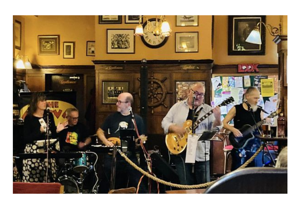
THE ENTERTANING PORTSMOUTH BAND 'THE MUVVAS'