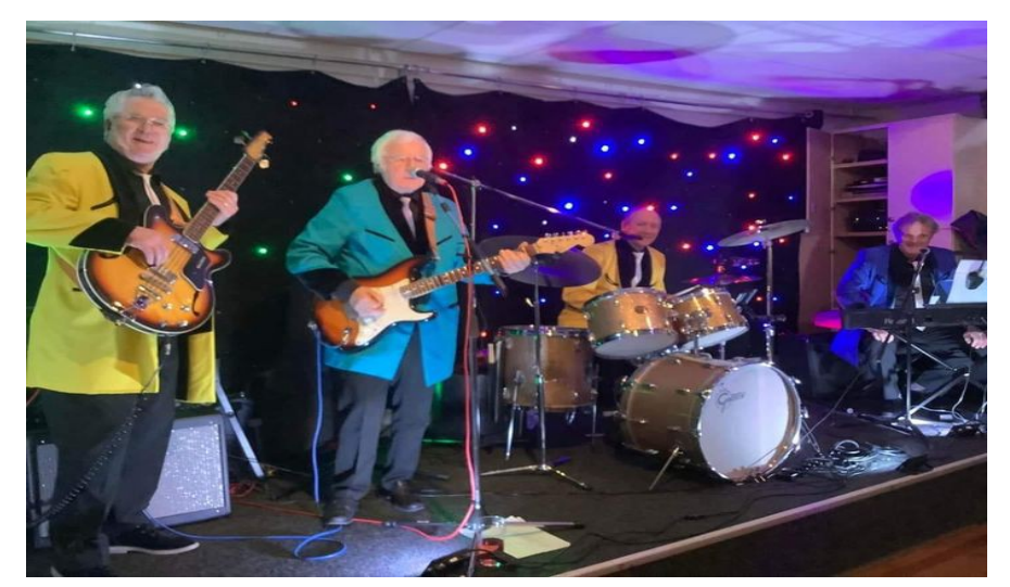
GOSPORT BASED BAND CHEVY 55 Rock 'n' Roll